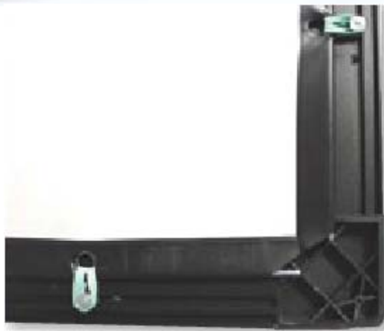
PLASTIC JOINT EDGE