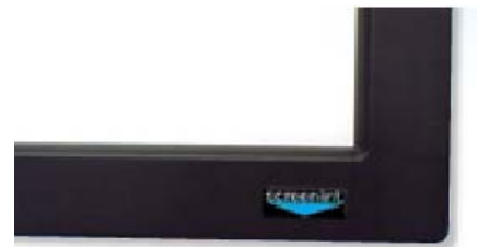
ANCHORING SYSTEM VIEW