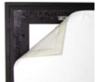
Perfectly flat 'Velcro' fastened surface.