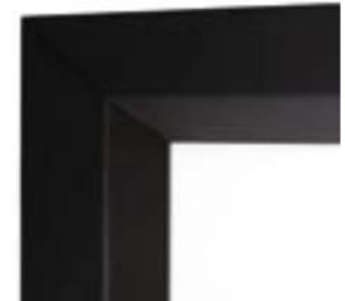
Factory mitred corners for a perfect join.