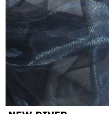
NEW RIVER CAMORGANZA11