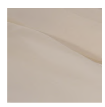
CHAMPAGNE CAMVOILE3 CAMVOILE23*