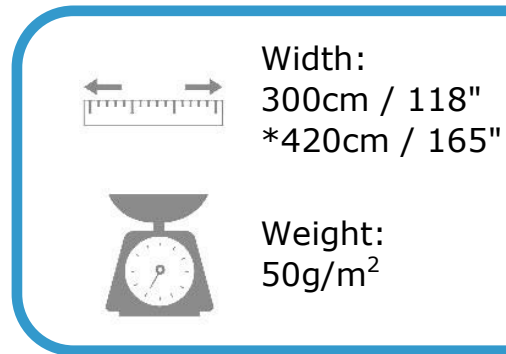
300cm / 118"