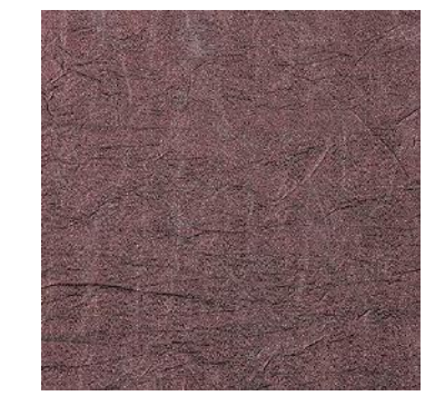
RUST PINK CAMLCY006