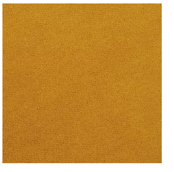
TRUE GOLD CAMVELH042