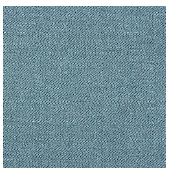
ICE BLUE CAMDIM029